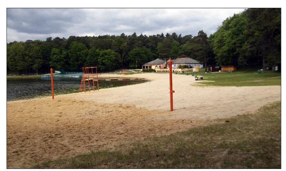
Photo 1. The municipal bathing beach by the Deep lake in Szczecin (27th May, 2015)